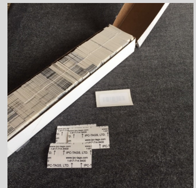
Labels are supplied in boxes of 1000 labels.

Exceeds Industrial Wash and Dry Cleaning Testing Parameters: +100X commercial wash cycles, commercial washer 160 degrees +100X commercial dry-cleaning perc. and hydrocarbon (Dry Cleaning & Laundry Institute International)