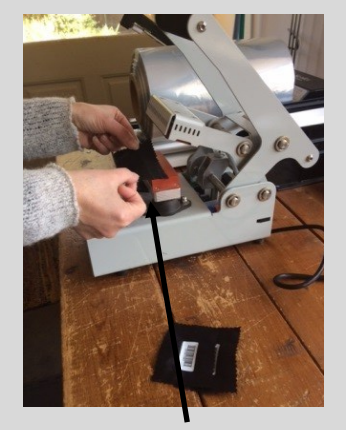
Place Label with barcode facing fabric with arrows up before Heat Seal Application of Label. See Moss instructions for placement on Apparel.