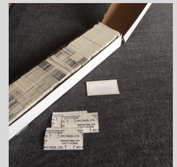
Labels are supplied in boxes of 1000 labels.